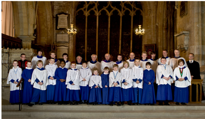
Boy Trebles 13th March 2011