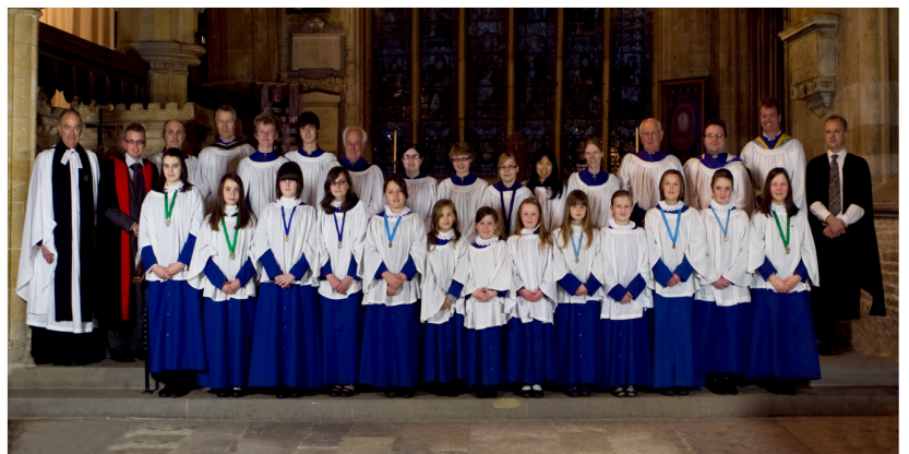
Girl Trebles 3th April 2011